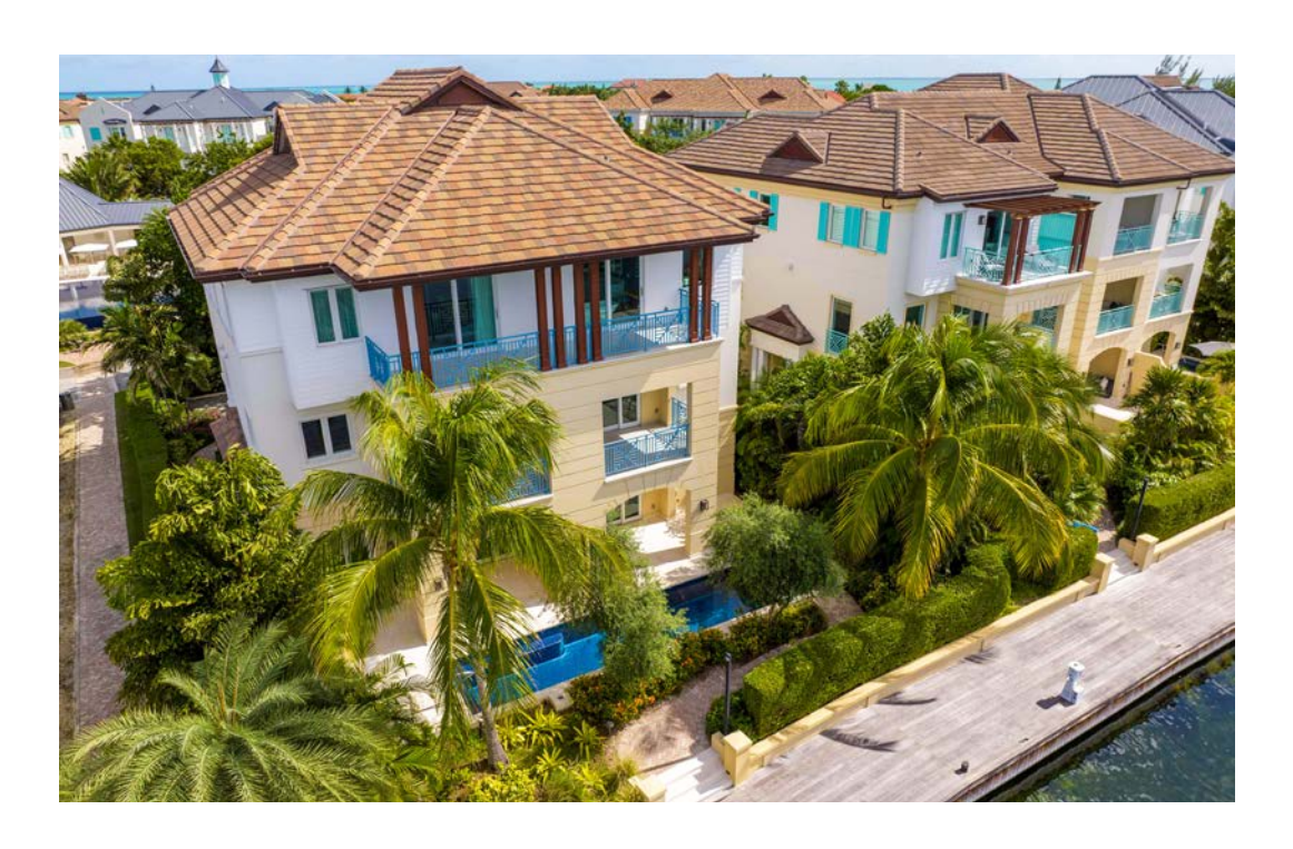
Exterior | Waterfront