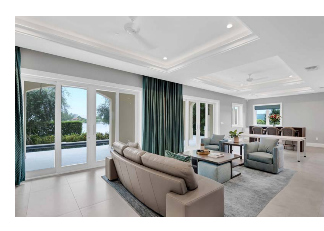
Living & Wet Bar | Entry Level