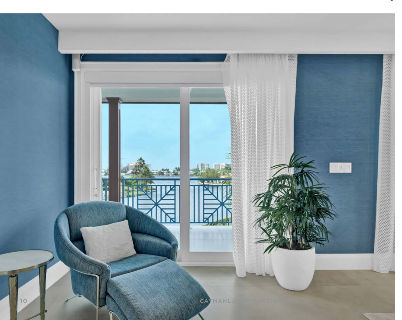
Primary Bedroom | Sitting