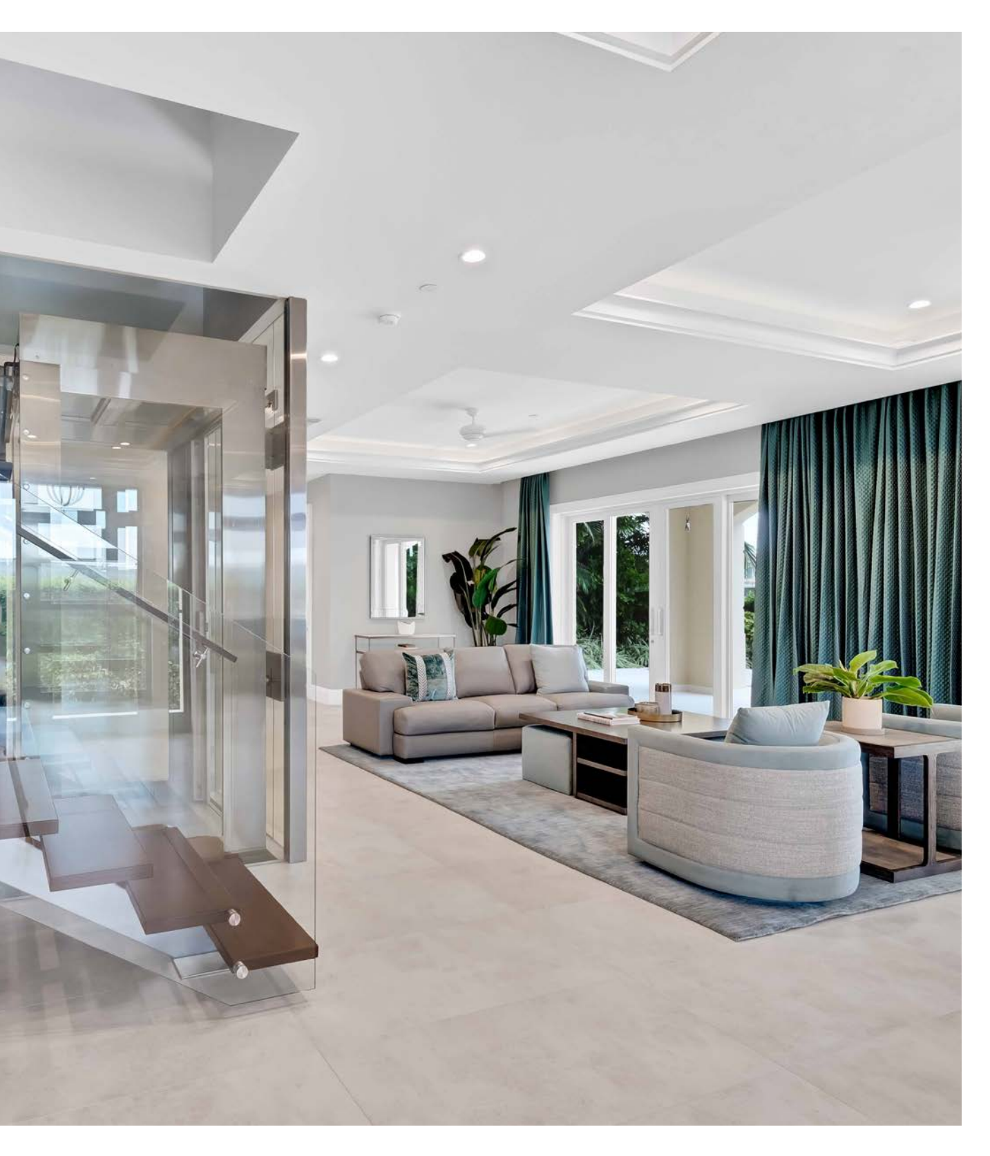
Living | Entry Level